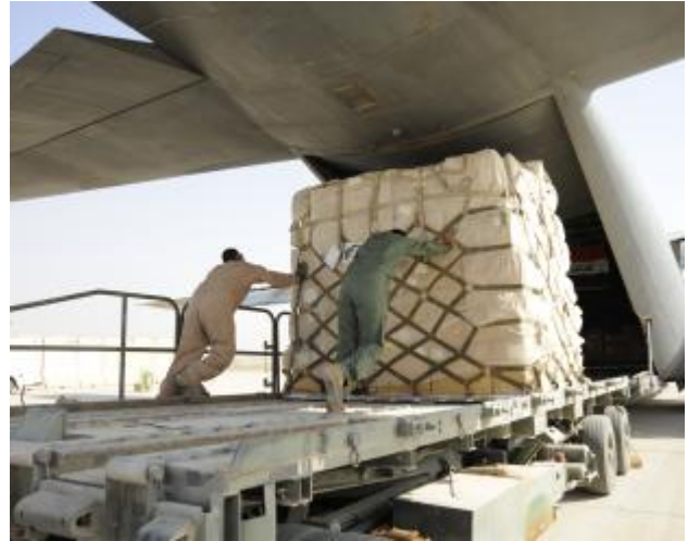
Iraqi air force loadmasters push a pallet of donated supplies onto an Iraqi C-130 at New al-Muthana Air Base, Iraq on, Sept. 22, 2008. This will be the first Iraqi air force C-130 supported humanitarian airlift to Najaf, Iraq. The supplies are to be donated to internally displaced Iraqis at Camp Al-Manathera.