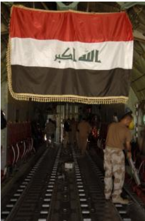
An Iraqi aircrew prepares its C-130 for flight at New al-Muthana Air Base, Iraq on, Sept. 22, 2008. The supplies are to be donated to internally displaced families at Camp Al-Manathera in Najaf, Iraq.