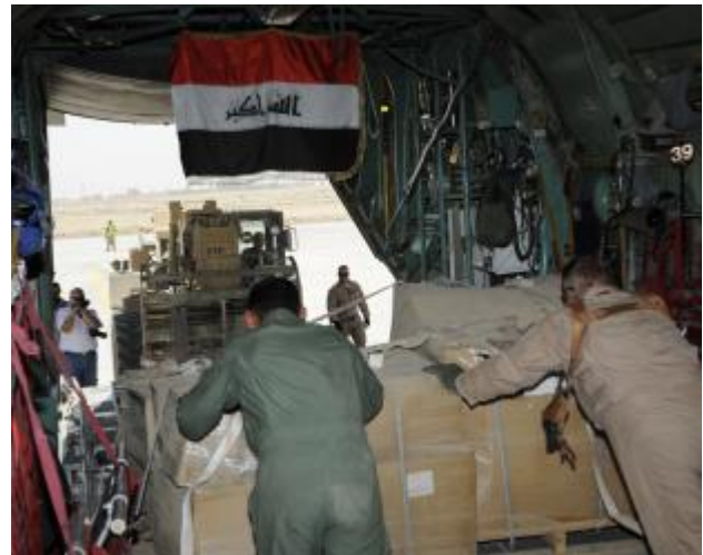
An Iraqi aircrew pushes a pallet off an Iraqi C-130 at Najaf, Iraq on, Sept. 22, 2008. The supplies are to be donated to internally displaced families at Camp Al-Manathera. This is the first Iraqi air force C-130 supported humanitarian airlift mission to Najaf.