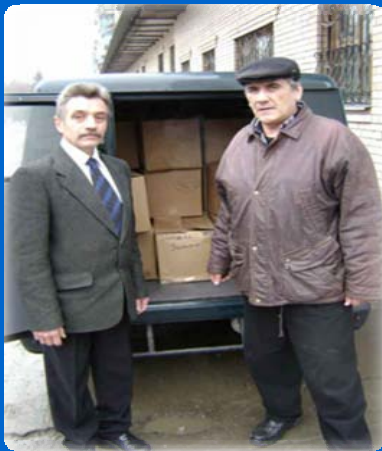
"This time some people from the boarding school in Kramatorsk came and we gave them a lot of stuff for the kids. It was school uniform and some stationeries."

"We gave many things to one organization which helps the people with AIDS. We had a long discussion as for Bible teaching. Some of them visit Pentecostals so they were surprised to hear some things from the Bible what we teach here. They promised to come Sunday."