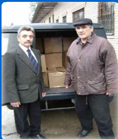
"This time some people from the boarding school in Kramatorsk came and we gave them a lot of stuff for the kids. It was school uniform and some stationeries."

"We gave many things to one organization which helps the people with AIDS. We had a long discussion as for Bible teaching. Some of them visit Pentecostals so they were surprised to hear some things from the Bible what we teach here. They promised to come Sunday."