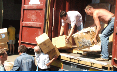
Unloading the container in Kramatorsk, Ukraine