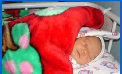
A newborn baby sleeps in a bassinette shipped on one of our containers

Next week we will go to Svytogorsk, and will stay there one week. 90 children 15 Americans (Jeff Abrams' team) and 15 Ukrainian adults will try to have one of the greatest camp ever. Please pray about it.