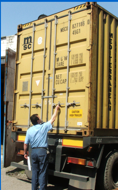
Another container arrives in Kramatorsk, Ukraine. This container was shipped from Ft. Collins, CO.