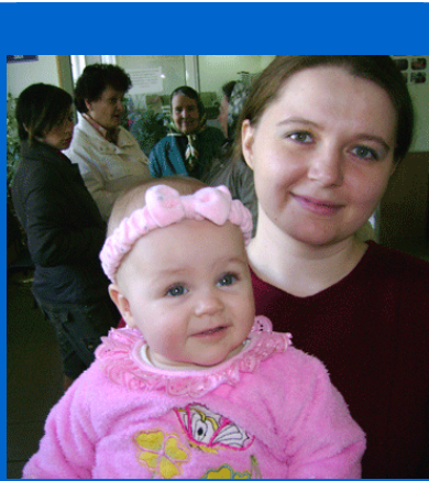
“Every thing my daughter wears is thanks to your sending shipments. Thank you for helping us!” A sister in the Lord from Kramatorsk, Ukraine