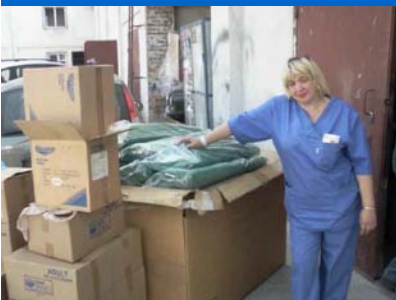
THROUGH OUR EFFORTS MANY CLINICS AND HOSPITALS RECEIVED SUPPLIES THEY HAD NEVER “DREAMED” OF RECEIVING FOR PATIENT SERVICES.

“Twenty ambulances were equipped with cots, splints, sheets, first-aid sets, disposable medical supplies needed to give people medical aid...The Head Doctor of the City First Aid Hospital looked at everything with surprise and said that never before had he received such aid...They could not hide their joy and thankfulness.”