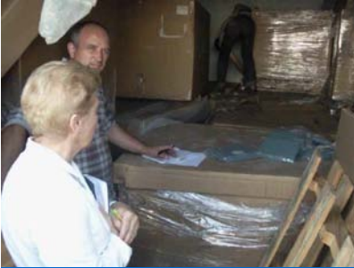
IVAN SKOLEBA DOCUMENTS THE DISTRIBUTION OF HOSPITAL LINENS TO A HOSPITAL IN THE IVANO-FRANKIVSK OBLAST THAT TREATED THOSE INJURED BY THE HISTORIC FLOODING.

“Twenty ambulances were equipped with cots, splints, sheets, first-aid sets, disposable medical supplies needed to give people medical aid...The Head Doctor of the City First Aid Hospital looked at everything with surprise and said that never before had he received such aid...They could not hide their joy and thankfulness.”