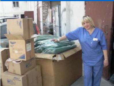
THROUGH OUR EFFORTS MANY CLINICS AND HOSPITALS RECEIVED SUPPLIES THEY HAD NEVER “DREAMED” OF RECEIVING FOR PATIENT SERVICES.

“Twenty ambulances were equipped with cots, splints, sheets, first-aid sets, disposable medical supplies needed to give people medical aid...The Head Doctor of the City First Aid Hospital looked at everything with surprise and said that never before had he received such aid...They could not hide their joy and thankfulness.”