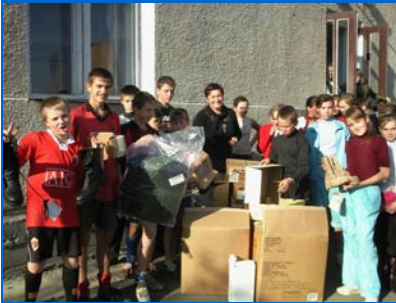
CHILDREN IN A VILLAGE SHOW THE BOOTS, CLOTHING, AND BED LINENS THAT WERE BROUGHT TO THEIR VILLAGE TO AID THOSE WHO WERE RUINED BY THE FLOODS.

"I could not imagine that this humanitarian aid from American Brothers and Sisters would bring forth such good fruits, would open doors to institutions where people did not want to even hear about us before...Now we can freely go to many places such as schools, orphanages, hospitals, and share Gospel with people. And it's very important that people in Western Ukraine learn more and more about church of Christ. Without your help and concern we would not be able to do what has already been done."